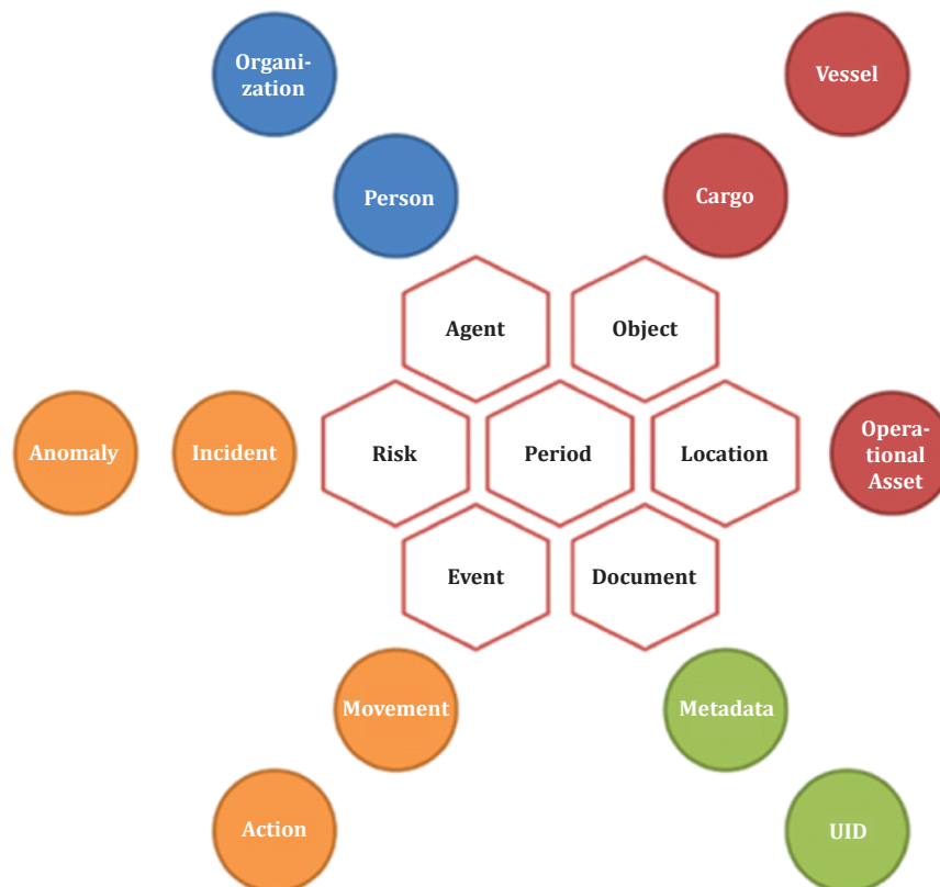
Figure 2 The original CISE Data Model

In the first stage of CISE implementations, the primary objectives are the translations and exchanges of data, and facilitation of the basic services between different organisations and their legacy systems. This means that the full-scale national CISE network, data and service model implementations, as envisaged, might not be the immediate objective for joining organisations such as AMSPM or police. Their legacy systems are already operational within the current scope. The CISE offers controllable and gradual augmentation of the existing capabilities (see 2)), via collaborations,