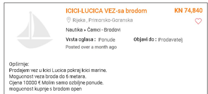
Figure 2 Advertisement for selling a berth 1