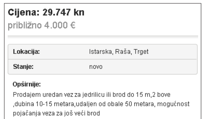
Figure 3 Advertisement for selling a berth 2