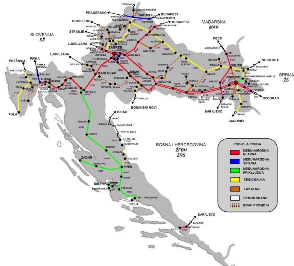
Figure 3 The Railway Connection of the City of Zadar on the Network of HŽ (the Croatian Railways)