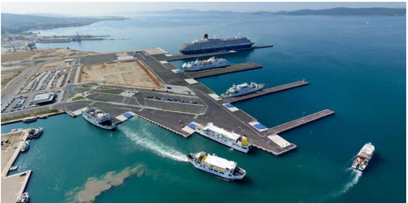
Figure 1 The Port of Gaženica

Due to its position in the heart of the Adriatic Sea, the Zadar County represents an important traffic hub that connects the north and the south of the Croatian coast and the Dalmatia region with other parts of Croatia as well as with other countries of the European Union and wider. Thanks to the highway A1 Zagreb – Zadar – Split – Dubrovnik, as a part of the Adriatic and Ionian traffic route with a connection to Zadar (Port of Gaženica), and to other state, county and local roads, air links (regular, low-cost and charter flights to a numerous foreign and domestic centres), sea links (ferries, ships, cruisers, etc.) and railway traffic, the area of the City of Zadar has become recognized as an easily reached destination with a numerous interesting sites in the city and its surroundings. A rich cultural heritage, areas of natural beauty with national and nature parks located nearby the city classify the City of Zadar at the very top of the Croatian tourist offer. The City of Zadar is a destination easily reached either by land, sea or air. It has a good traffic infrastructure through which it is directly connected to other larger Croatian cities like Zagreb, Rijeka, Split and Dubrovnik, with outstanding capacities and contemporary service of numerous marinas. The ferry port as well as the new cruiser port are located in the new spa-