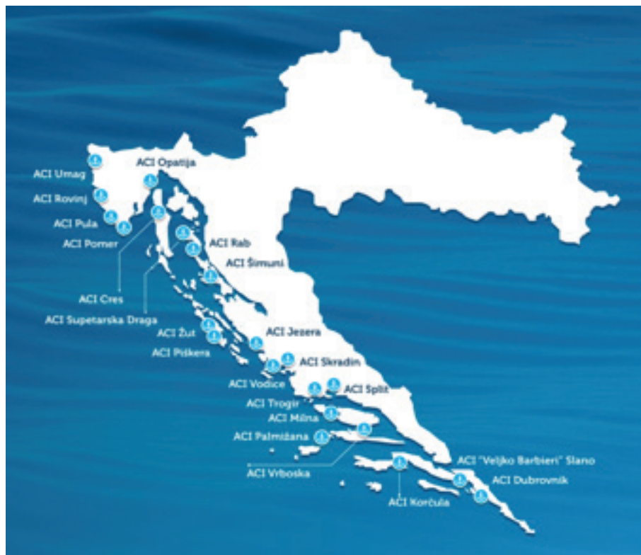
Figure 3. ACI marinas in Croatia, Source: Adriatic Croatia International Club (2019).

In the Adriatic Croatia International Club (ACI), the largest marina system in the Mediterranean and the leading Croatian nautical company, 22 marinas are operating, as shown in Figure 3.