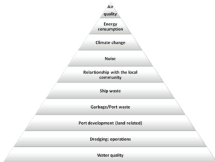
Figure 1. Environmental priorities of European ports, Source: ESPO Environmental Report (2019).

(ESPO) and the ports participating to the EcoPorts network regularly monitor the environmental priorities of European port authorities (Figure 1) to identify the high priority environmental issues and set the framework for guidance and initiatives to be taken by ESPO (Scientific Enterprises Ltd, 2015).