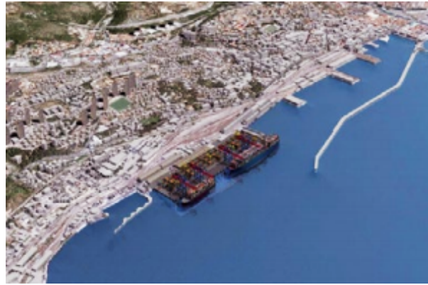
Figure 3. Zagreb Deep Sea Container Terminal

The two ports could also be compared to each other based on their location. Both of them are located on the branches of the Corridor V. Port of Rijeka is situated on the Corridor Vb, while the port of Ploče is situated on the Corridor Vc. Port of Rijeka and port of Ploče are the only ports on their branches. Corridor Vb is located close to the main branch of the Corridor V. Also, the port of Rijeka is located near the Italian and Slovenian ports on the Corridor V. Unlike the port of Rijeka, the port of Ploče is not located close to the main branch of the Corridor V. It is also the southernmost point of the Corridor V.