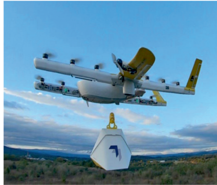
Figure 6.: Wing drone deployment technology [35]