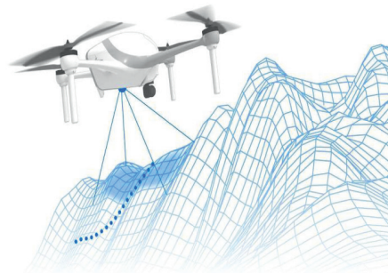
Figure 2: Visual mapping of the drone surroundings [15]