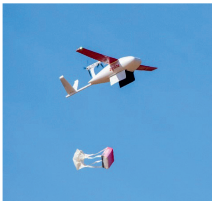
Figure 3.: Drone delivery using parachute [16]

The third method involves using a parachute for package delivery. After the package is delivered, the drone returns to the initial location, and continues the delivery cycle.