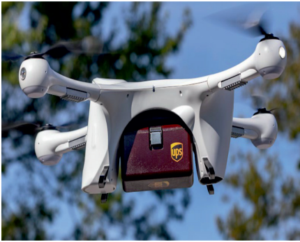
Figure 5.: UPS delivery drone deployment methodology [34]