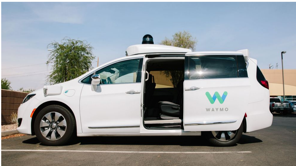
Picture 3: Waymo Autonomous taxi company which served over 100,000 customers

The Future of Driving report from Ohio University states that with autonomous taxis, "The waiting time for a cab will come down from the average five minutes today to just 36 seconds. The cost of a ride too will come down to just $0.5 per mile in a driverless car." 28 Since every autonomous vehicle will be able to be used for ridesharing, the ridesharing market will be huge. Mobility will be cheap, reliable and everyone will be able to afford it. It is likely to happen that ridesharing becomes so efficient that many people will choose not to have a car and yet to be driven every day constantly.