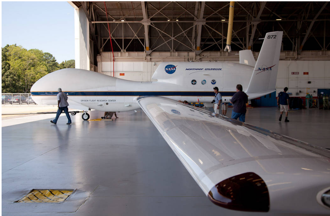
Picture 9: US Northrop Grumman Global Hawk reconnaissance and science drone.