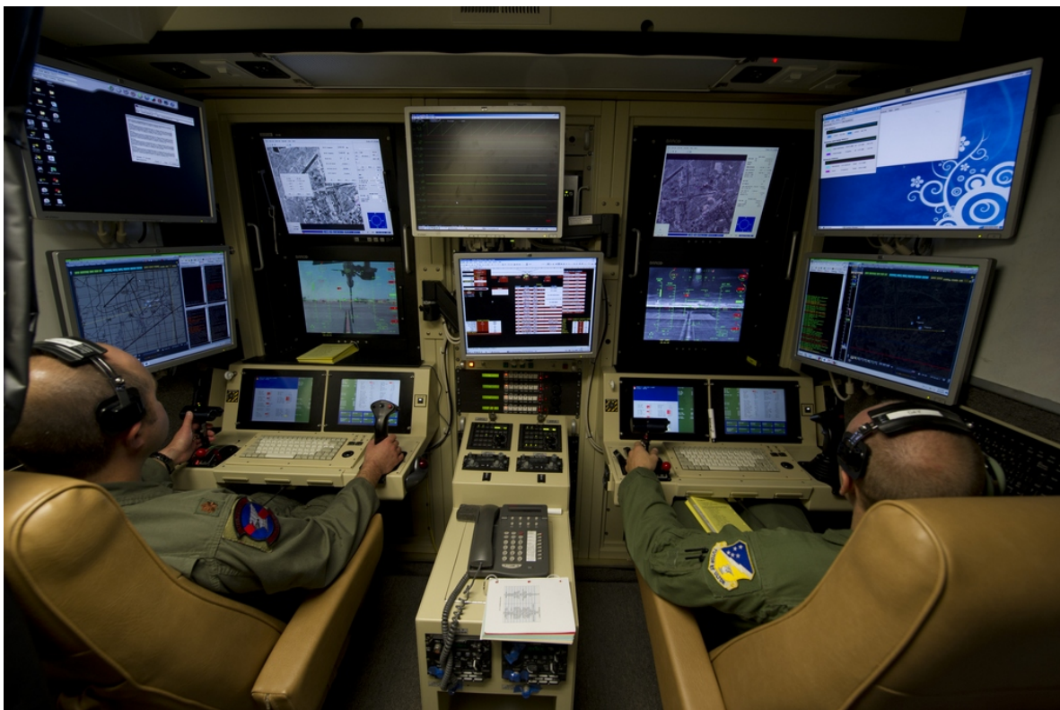
Picture 9. MQ-1 Predator control room used by the U.S in 2007.

The U.S. saw the military potential of drones and began actively researching them, by 1990 miniature and micro UAVs were introduced and in 2000 the U.S. deployed its most famous drone the “Predator” while on the hunt for Osama Bin Laden. The drones were constantly used and became a recognizable symbol of the U.S. Air Force until 2018 when it was replaced by a newer and more capable version of the predator, the MQ-9 Reaper or often called as the “Predator B” 49