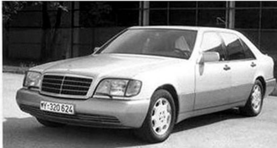
Picture: 1. VaMP 1994