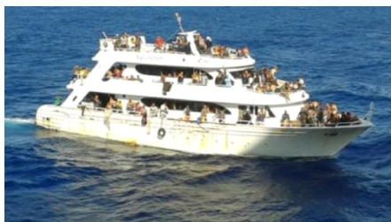
Figure 3 - Approach of the craft in distress.