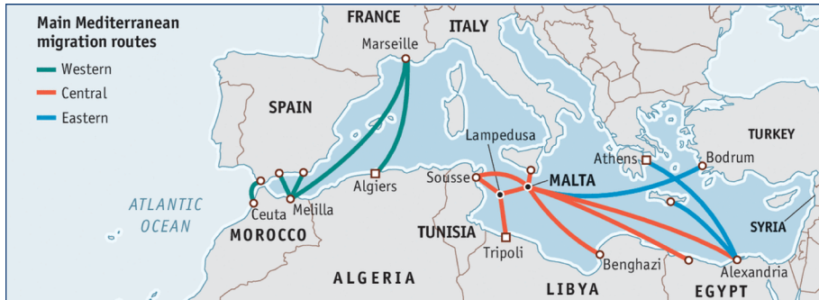
Figure 1 - Major immigrant routes in the Mediterranean Sea [1]

Syria) countries using sea routes to reach Turkey, Greece or Cyprus. The routes in the Central region cover Egypt, Libya and Tunisia as departure points, using Italian islands (Lampedusa and Pantelleria) as waypoints, and having Malta, France and Italy as destinations. Because of the shortest distance between Africa and Europe, this route is the most frequent sea route used by immigrants. The Western region is the least frequent one, and covers the routes from Algeria and Morocco, toward Spain and France. [2, 5, 28].