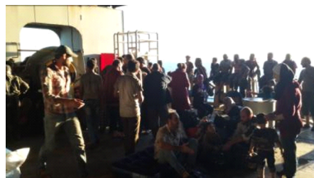
Figure 4 - Accommodation of immigrants on board.