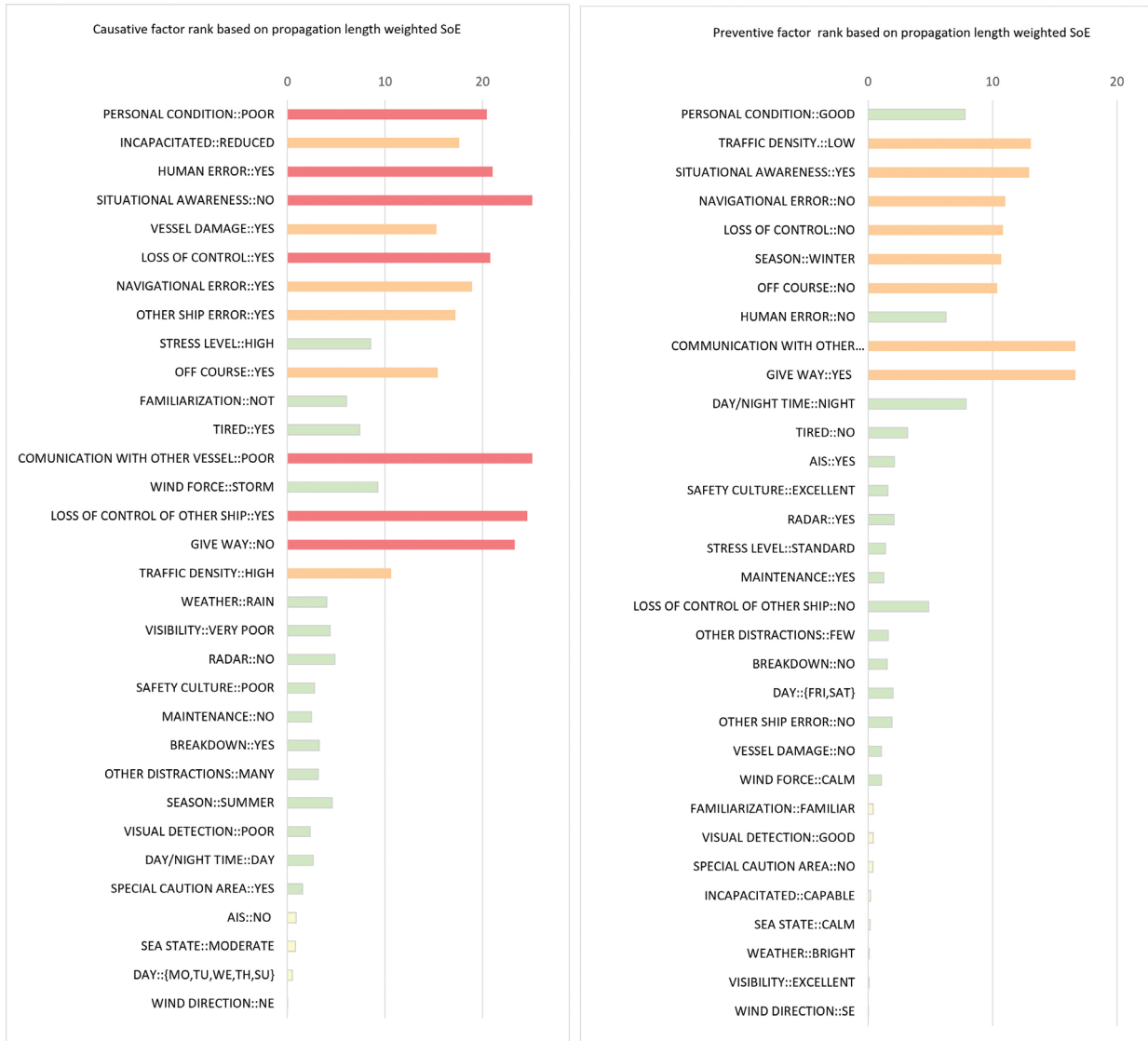
Figure 4. Importance ranking based on propagation length weighted SoE.

According to the ranking based on weighted SoE, extremely strong and the strong causative, as well as the strong preventive influencing factors, are obtained and shown in Fig 4. It yields that the extremely strong causative influencing non-adjacent factors are poor personal condition, human error, lack of situational awareness, and a loss of control. This reasoning is supported by the results of preventive factor ranking, where good situational awareness is the highest ranked preventive factor. Previous studies and experience have recognized contribution of these human related factors and a lack of situational awareness in the collision causation, and in particular in the collision causation of