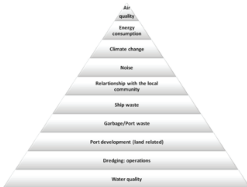
Figure 1. Environmental priorities of European ports

(ESPO) and the ports participating to the EcoPorts network regularly monitor the environmental priorities of European port authorities (Figure 1) to identify the high priority environmental issues and set the framework for guidance and initiatives to be taken by ESPO (Scientific Enterprises Ltd, 2015).