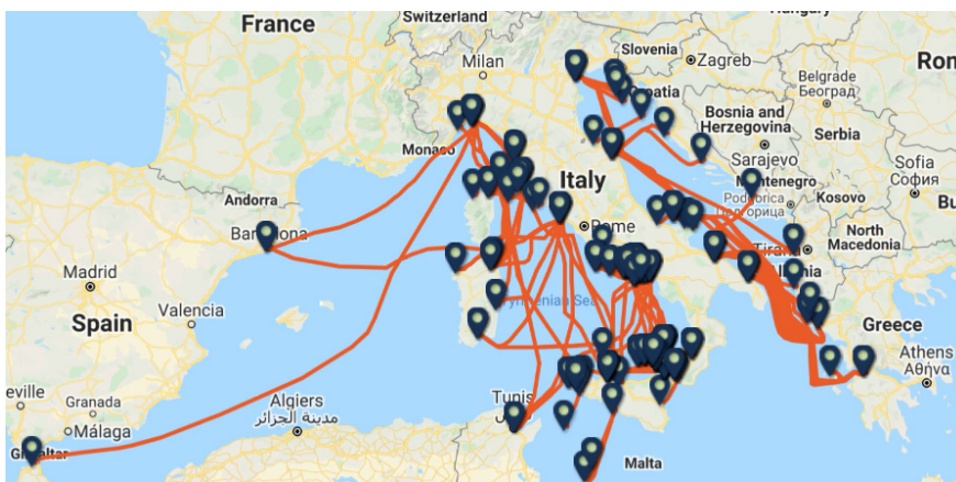
Map 1 Italian Ferry Lines[16]

Italy is a country with a long maritime tradition and has been a leader in coastal liner passenger transport for years. There are many ferry companies operating ferry routes in Italy, as well as Italy's connections with other countries such as France, Greece and or Croatia. There is currently a wide range of ferries connecting Italy to over 28 destinations, and ferries sail weekly from various ports around the world to other ports in Italy. The lines are shown on map 1.