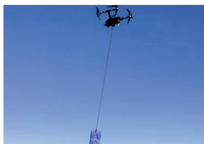
Figure 4.: Drone delivery using cable [17]