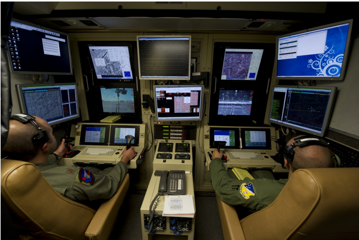
Picture 9. MQ-1 Predator control room used by the U.S in 2007.

The U.S. saw the military potential of drones and began actively researching them, by 1990 miniature and micro UAVs were introduced and in 2000 the U.S. deployed its most famous drone the “Predator” while on the hunt for Osama Bin Laden. The drones were constantly used and became a recognizable symbol of the U.S. Air Force until 2018 when it was replaced by a newer and more capable version of the predator, the MQ-9 Reaper or often called as the “Predator B” 49