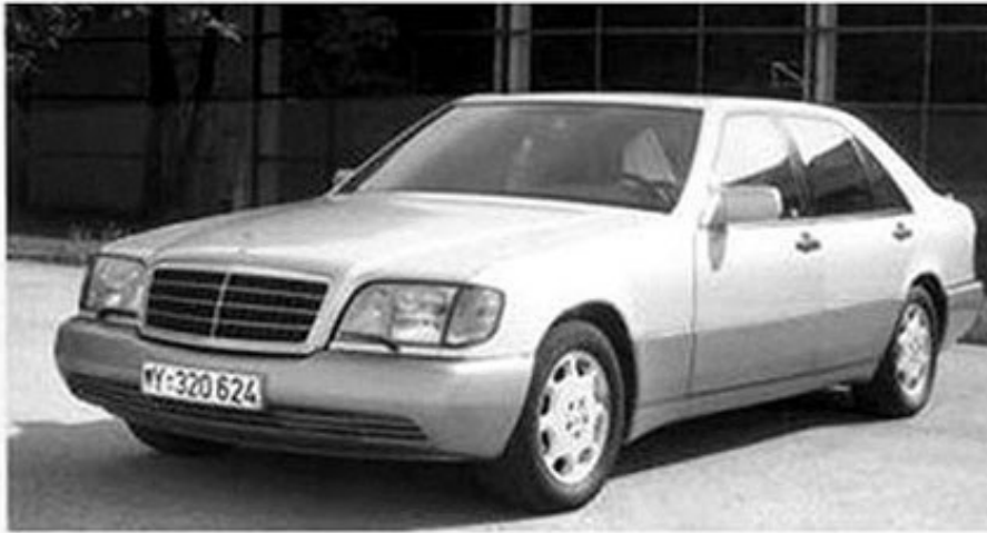
Picture: 1. VaMP 1994

Source: https://medium.com/@davidrostcheck/the-self-driving-car-from-1994-fb1ec617bd5a (03.07.2020)