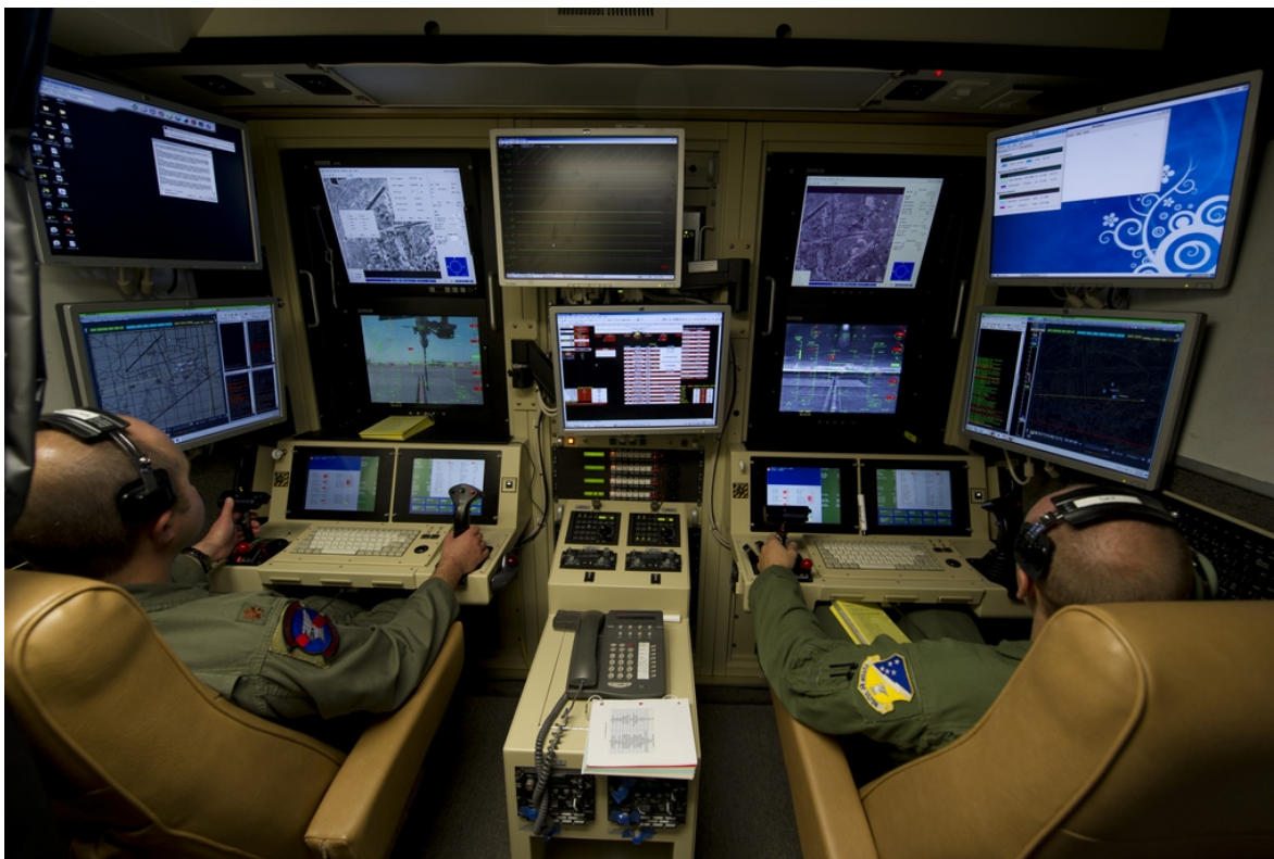
Picture 9. MQ-1 Predator control room used by the U.S in 2007.

The U.S. saw the military potential of drones and began actively researching them, by 1990 miniature and micro UAVs were introduced and in 2000 the U.S. deployed its most famous drone the “Predator” while on the hunt for Osama Bin Laden. The drones were constantly used and became a recognizable symbol of the U.S. Air Force until 2018 when it was replaced by a newer and more capable version of the predator, the MQ-9 Reaper or often called as the “Predator B” 49