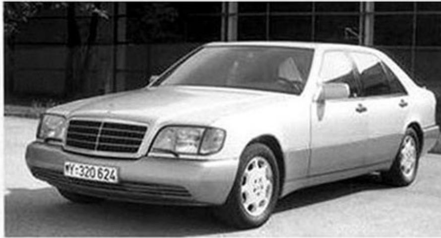
Picture: 1. VaMP 1994