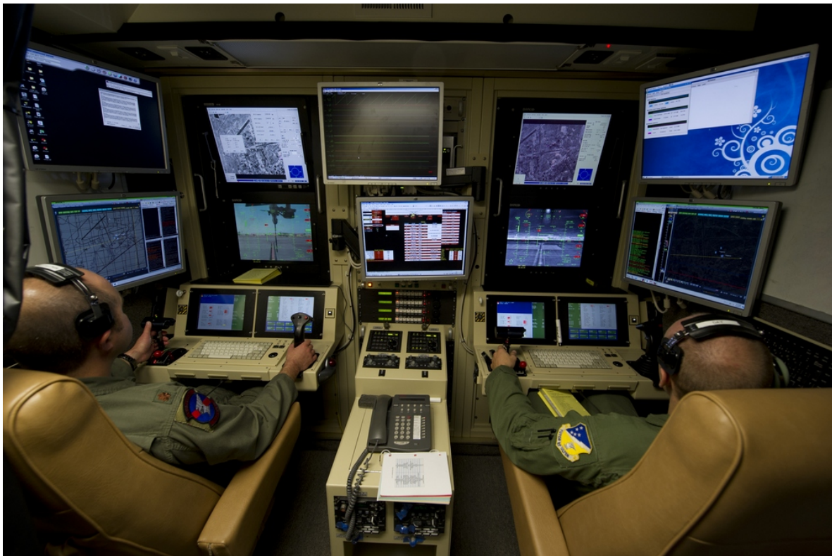
Picture 9. MQ-1 Predator control room used by the U.S in 2007.

The U.S. saw the military potential of drones and began actively researching them, by 1990 miniature and micro UAVs were introduced and in 2000 the U.S. deployed its most famous drone the “Predator” while on the hunt for Osama Bin Laden. The drones were constantly used and became a recognizable symbol of the U.S. Air Force until 2018 when it was replaced by a newer and more capable version of the predator, the MQ-9 Reaper or often called as the “Predator B” 49