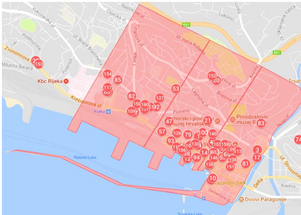
Figure 1 Economic entities grouped into Zones 1, 2, and 3