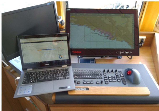
Figure 3 The cyber security testing setup.

The cyber security testing of the ECDIS was performed using the industry most widely used vulnerability scanner, the Nessus Professional version 8.0.1 (Nessus, 2019). The vulnerability scanning is a computational method of detecting cyber vulnerabilities, which are known not only