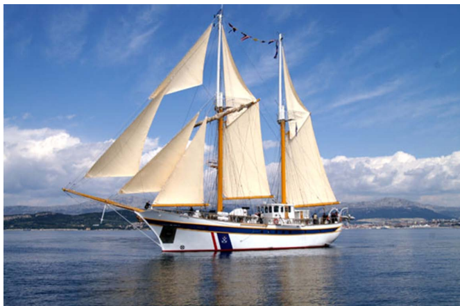
Figure 1 Training and research ship Kraljica mora .