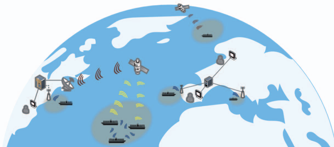
Figure 2 Overview of Satellite and Terrestrial AIS Segments

Terminal organization and decision making is made on several levels of planning. Operational plans are usually made for daily, weekly, ten days and monthly operations. Daily operations include berth and quay cranes allocation.