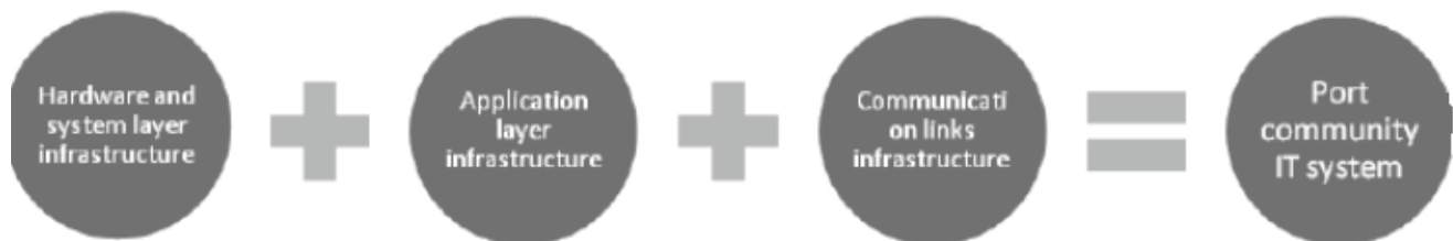
Figure 2. General composition of PCS module.

As mentioned above, the Port of Split will have the option of PCS implementation after the Ports of Ploče and Rijeka. The systems comprised of modules are either already implemented or are in the process of implementation in those Ports. Each Port's system should have the same basic modules, while additional modules would differ depending on the specific needs of an individual Port. The proposed modules belong to the class of business application software that also includes information router service and certificate server used for user authentication. General composition of PCS modules is shown in Figure 2.