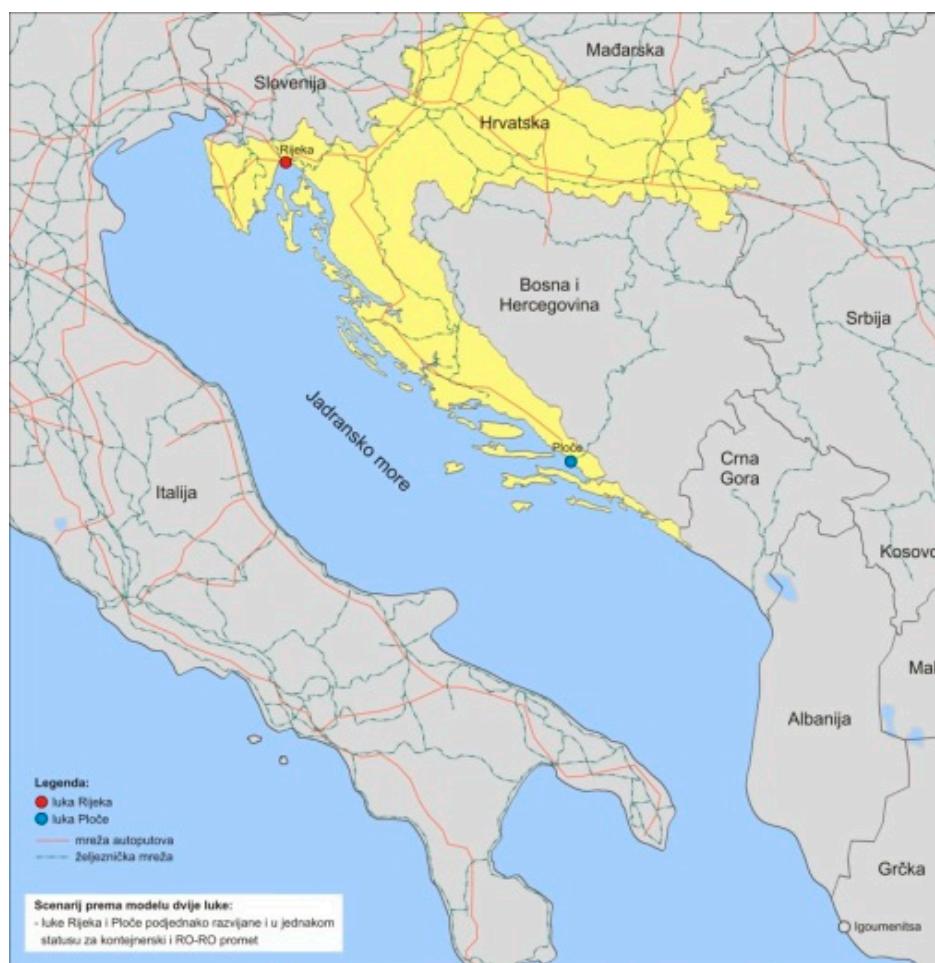
Figure 1. Model of implementation of a sustainable Motorways of the Sea through two ports in the Republic of Croatia.

In the case of a simultaneous influence of the infrastructural and administrative-political criteria groups, or the influence of the infrastructural criteria group only, the model of a single port is greatly advantageous because the condition of the conjoined traffic infrastructure, as well as of the means of manipulation in the terminal of the port of Ploče, is at a very low level. When the road infrastructure, which is currently under construction, allows for an undisturbed connection to the highway network and the railroad infrastructure is brought to a level of regular functioning, the model of a single port will not be dominant anymore, leaving space to the model of two ports, which will be preferable.