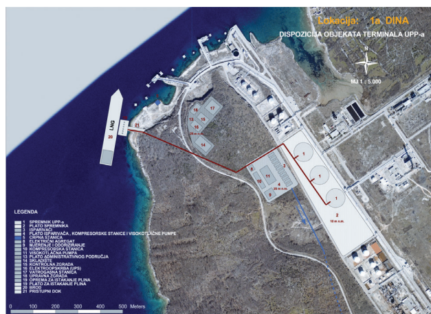
Figure 3 Selected location to accommodate the LNG receiving terminal

In future research, it would be important to elaborate in more detail all the elements of multicriteria decision-making and to define wider number of relevant criteria which are relevant for location of LNG terminal as well as determine which of the multicriteria decision-making methodologies is best used for each of the key stages of project implementation before and during the construction of infrastructure facilities and LNG terminals.